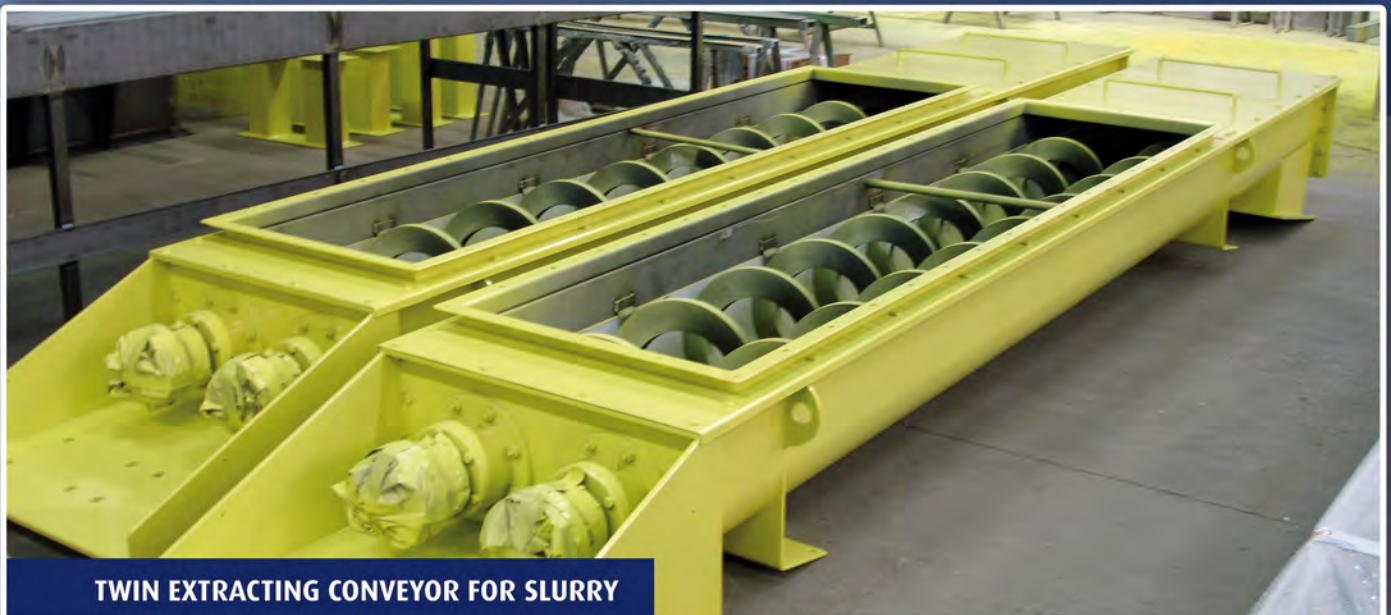
TWIN EXTRACTING CONVEYOR FOR SLURRY